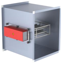
Example illustration: System mounted in an air-duct as slide-in

-xxx: Power / Controller Connector to choose