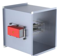
Example illustration: System mounted in an air-duct as slide-in

-xxx: Power connector and Control unit equipment to choose